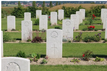
1 Villers-Bretonneux Cemetery

soldiers killed with no known grave on the Western Front during WW1. The journey through the Somme visiting Le Hamel, Peronne and The Thiepval Memorial to the missing of the Somme was extremely emotional. It was difficult to comprehend how such a peaceful beautiful French countryside was such a place of bloodshed and tragedy for thousands of soldiers. The stories of the battles, the viewing of the trenches and the discovery of a relative's grave moved many of us to tears. The cemeteries were numerous down many a quiet country road through peaceful villages and in unexpected places, but all impeccably maintained.