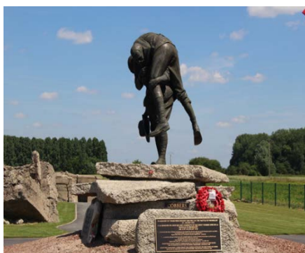
Figure 2 Cobbers Memorial near Bullecourt

Memorials dedicated to the Australian forces were scattered throughout the area with the most moving being the Bullecourt Digger statue and "cobber" memorial.